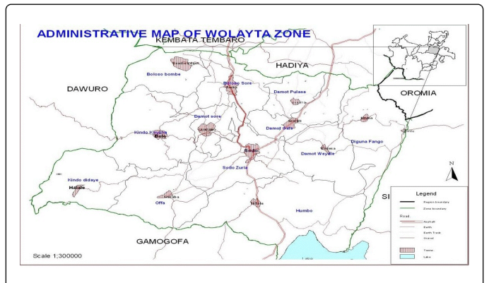
Figure 2: Map of Wolayta Zone