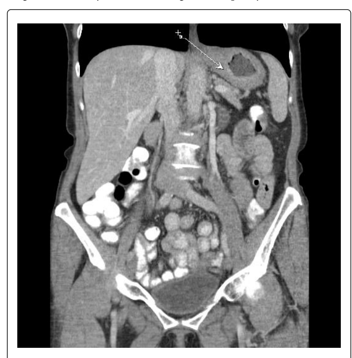
Figure 1a: Computed tomography (CT) scans of stomach cancer in a 70-year-old patient. She has received three cycles Epirubicin, Cisplatin and Xeloda and no change was established.

In a now 70 year old patient (Figure 1) an adenocarcinoma of stomach with coeliac lymph node metastases (T3N1Mx) was in November 2010 established by gastroscopy, biopsy and computed tomography (CT) scan. From December 2011 until May 2012 six cycles Epirubicin (79 mg/m<sup>2</sup>), Cisplatin (76 mg/ m<sup>2</sup>) and Xeloda (1000 mg/ m<sup>2</sup>) were given. After three cycles the question arose as to whether her gastric tumor is responsive to this chemotherapy or not. Therefore in February 2012 a CT scan investigation was carried out and no change was established. The next three cycles of the same chemotherapy were combined with standardized immunomodulators and thereafter in May 2012 CT scan investigation showed a nearly complete remission. In Juni 2012 was the rest of tumor chirurgical removed. Until April 2014 the patient received only immunomodulators without an oncologic treatment and CT scan investigations did not show any relapse of her diseases. Her body weight increased by more than 10 kg and her quality of life is excellent.