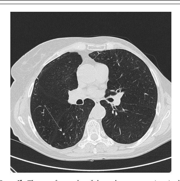
Figure 2b: The next four cycles of chemotherapy were given in the same doses but combined with ME/ML, BioBran and WGE. After four months nearly complete remission was observed, and the surgical operation was not necessary.

In the last two cases (illustrated on figure 1 and 2) the possibility cannot be ruled out that the remissions may be due to the time elapsed. Still, taking the previous clinical data into consideration these cases may also support the hypothesis that a combination of immune therapy with cytostatic drugs may be of additional benefit compared to a monotherapy with either substance. In addition, in second case report it is very improbable that low doses of Xeloda alone can induce a complete remission of lung metastasis suggesting a hypothesis that