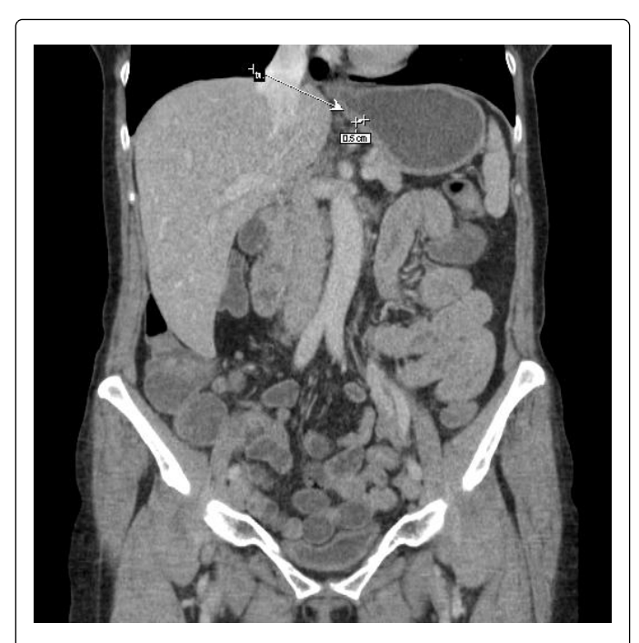
Figure 1b: Figure 1: The next three cycles chemotherapy were given in the same doses but combined with ME/ML, BioBran and WGE and after three months nearly complete remission was observed.

Another 65 years old patient (presented in figure 2) had a ductal mammary carcinoma [T2 N1 (2/14) M0], a tumorectomy was carried out in May 2003, and subsequently six cycles chemotherapy and irradiation (50GY) were adjuvant given. In June 2011 a lung metastasis was established in right segment 6 (S6) by PET/CT scan which was in July 2011 chirurgical removed by tumorectomy. In September 2012 a recidivation of lung metastasis in S6 was established by PET/CT scan. From Oktober 2012 low dose of Xeloda (2500mg/die) was applied and after four cycles the question arose as to whether her lung metastasis is responsive to this chemotherapy. Therefore a CT scan investigation was carried out in March 2013 which did not found any change. From March 2013 the same doses of Xeloda were combined with standardized plant immunomodulators and after the next four cycles in July 2013 a complete remission was established by PET/CT scan. The chemotherapy was stopped and only the immunomodulatory treatment was followed. The last PET/CT control in November 2013 did not find any relapse of her disease and her quality of life is excellent.